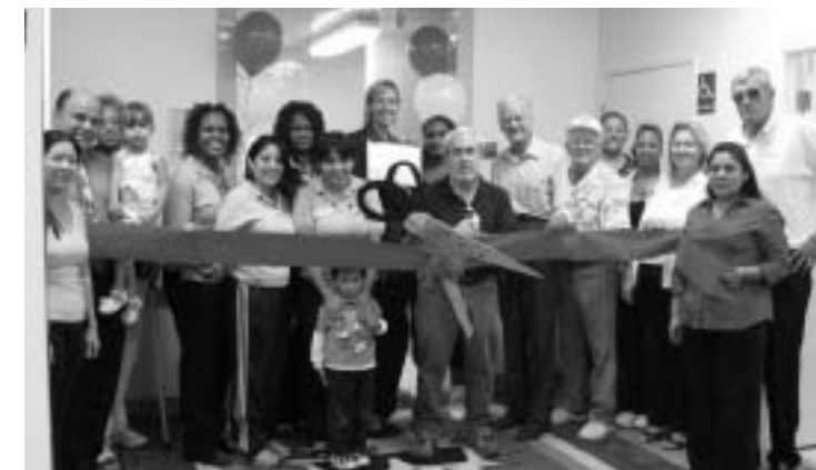
Ribbon-cutting ceremony for the new Gerber Family Changing Room