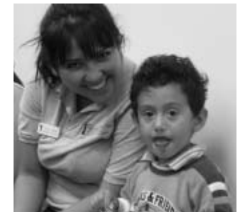
YMCA staff and child attend opening.