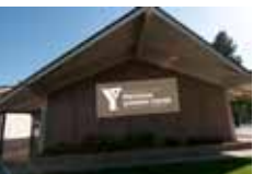
Preschool Learning Center